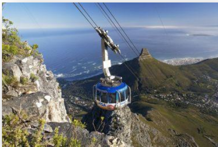
Table Mountain is one of the official New 7 Wonders of Nature, following a lengthy international public voting process. You can get to the top of Cape Town's most famous icon in just five minutes by taking a cable car up, or spend the better part of your day hiking it.

Once luggage has been loaded, you will depart on a City sightseeing tour, followed by excursion to Table Mountain